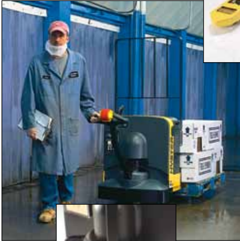
Short E Option