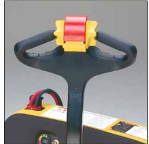
"Creep Speed" Control Button