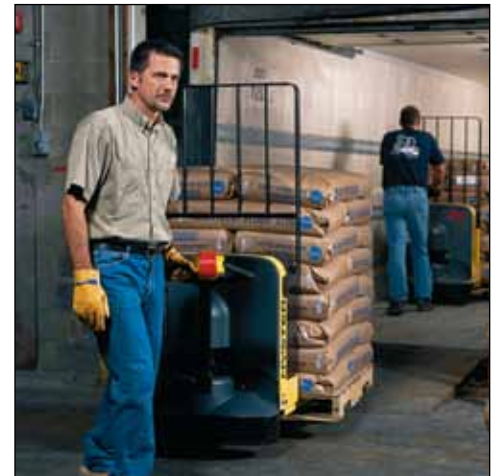
Truck shown with optional equipment