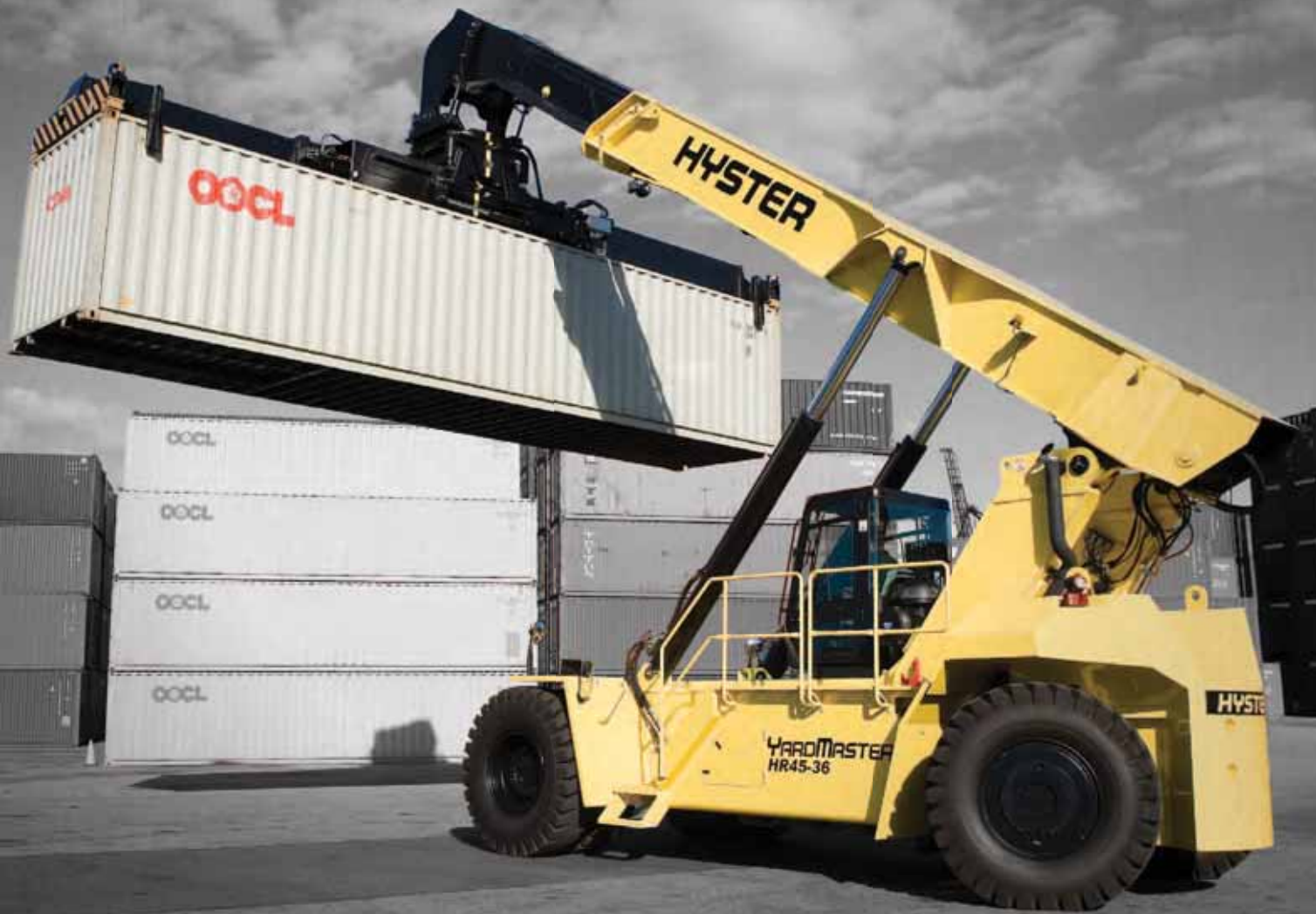
HR 45 ReachStacker